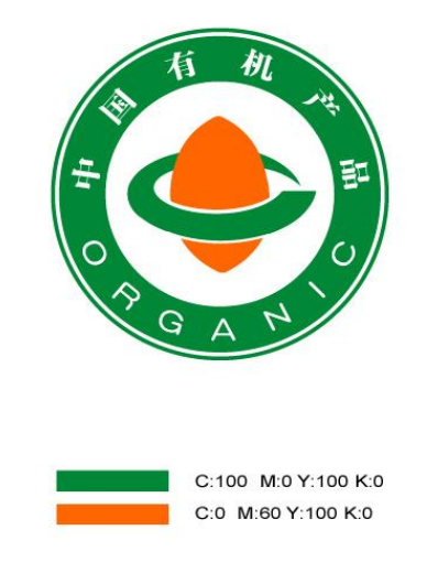
Graphic 1: Organic Product Certification Mark of China

7.2 All products presented "organic "or "Conversion to Organic " shall be affixed Organic Product Certification Mark of China or Conversion to Organic Product Certification Mark of China, its sole identification code, the name of certification body or its logo to the label for the certified products or the smallest selling package of the products.